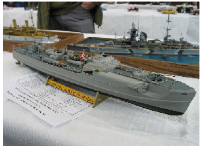
1/72 German Fast Attack Craft