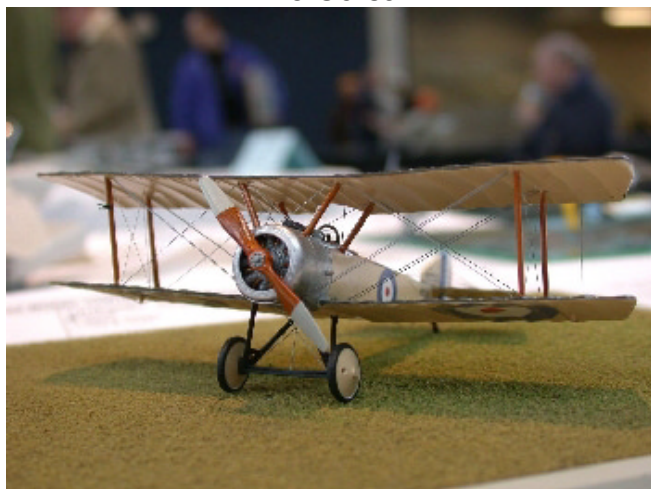
1/72 Sopwith Snipe