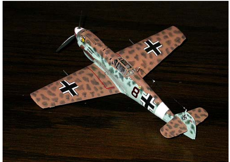
Bernie's Bf109E done with his mottling technique

Bernie recommended the use of the following tools and materials for use with this technique: