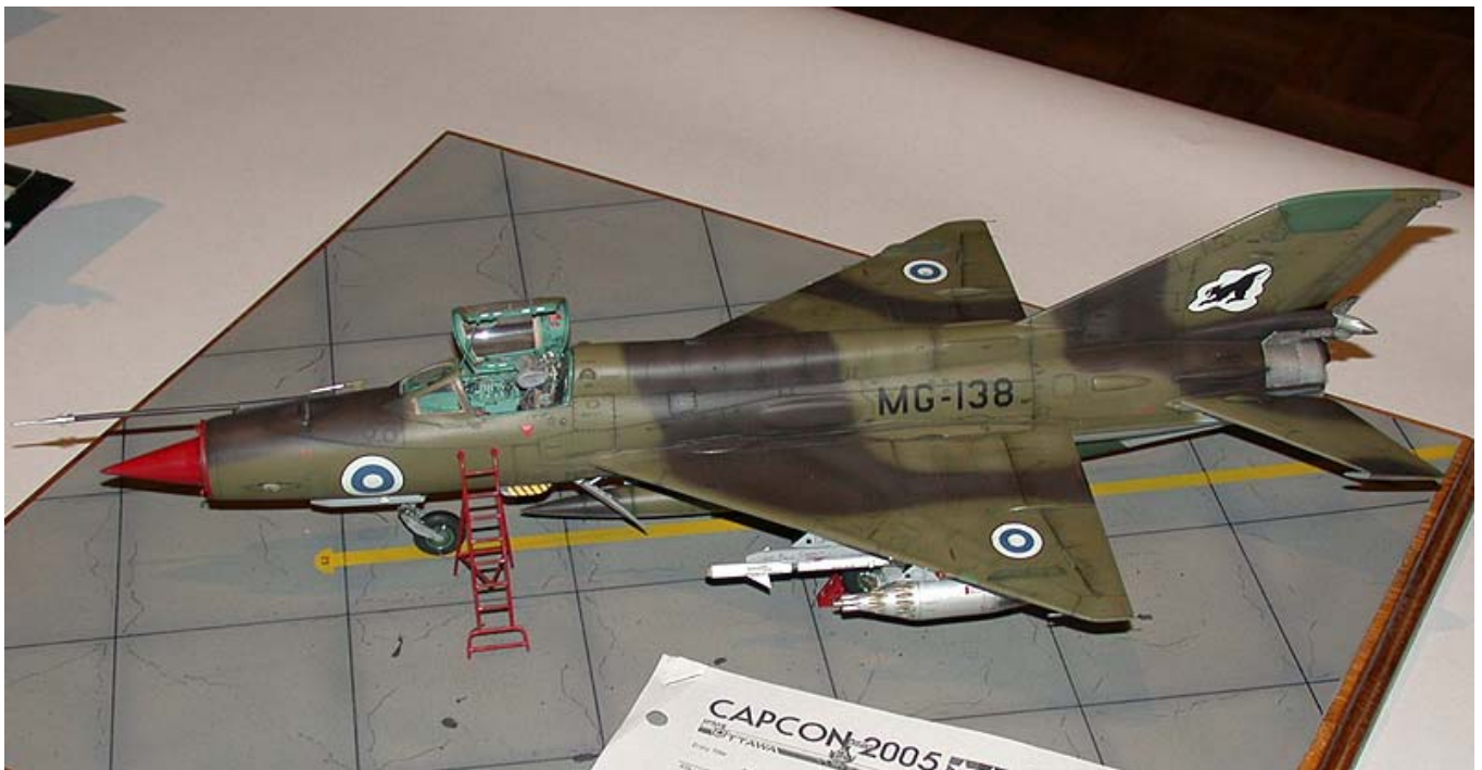
Best A/C of Show- Michel Laperriere

CAPCON 2005 was held on September 10, at the Nepean Sports Complex, kicking off the fall model show season in southern Ontario. Hosted by IPMS Ottawa, the show also had the added honour of being the concurrent venue for Tamiya-Con Canada.