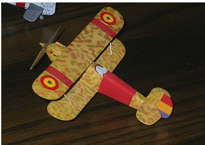
Bernie's beautiful Hawker Fury

Remember, that these products are not permanent and subject to inadvertent removal until sealed with an overcoat of clear.